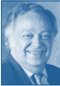
Sir Shridath Ramphal